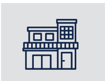
image layouts. Twin homes typically have two separate street addresses and can be owned by two different homeowners. Since outdoor maintenance is the responsibility of the homeowners, it is important to consider shared expenses that may need to be addressed, such as house siding, windows and upkeep of common spaces like the yard or shared driveway.

Also called a semi-detached, this home has two single-family dwellings that are separated by one common wall and have mirror